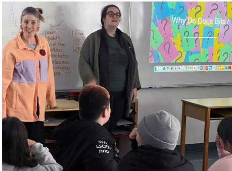
CAAT brings dog education into EVBS

for pet care and education. To date, CAAT has made four visits to the community — including two full veterinary clinics. Across these visits, a team of 34 volunteer veterinarians and vet techs have come to Pelly to provide spay and neuter services, vaccinations, nail trims, and pet health education. Their efforts have also included a Pet First Aid Workshop and Dog Bite Safety presentations for students at Eliza VanBibber School.