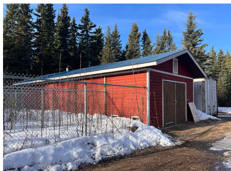
Shelter under Renovation

Our new dog shelter is more than just a place to house pets — it’s being reimagined as a vibrant, welcoming space for both animals and people. Thanks to recent renovations, the building will soon be ready to safely accommodate dogs and serve as a hub for community events like BBQs, parades, dog walks, kick sleds, and youth-led activities. Future plans include offering services such as grooming, nail clipping, and training sessions, as well as potential