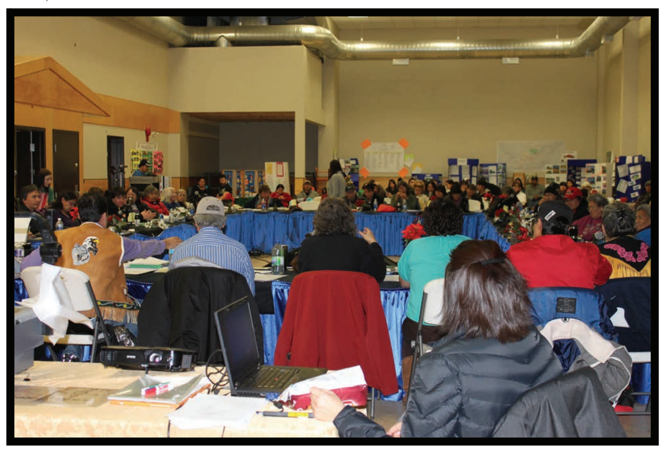
A full house at the 2013 SFN GA with all Department Booths in the background.