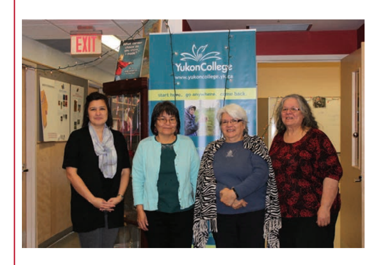
Yukon College Open House