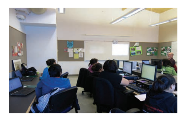
Digital skills for the work world workshop.