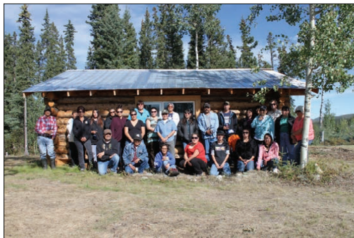
Everyone enjoyed the BBQ, relaxing, picking berries, canoeing and playing fun games!