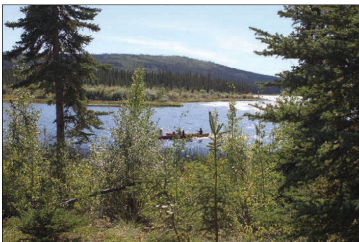
Staff enjoying a canoe ride.