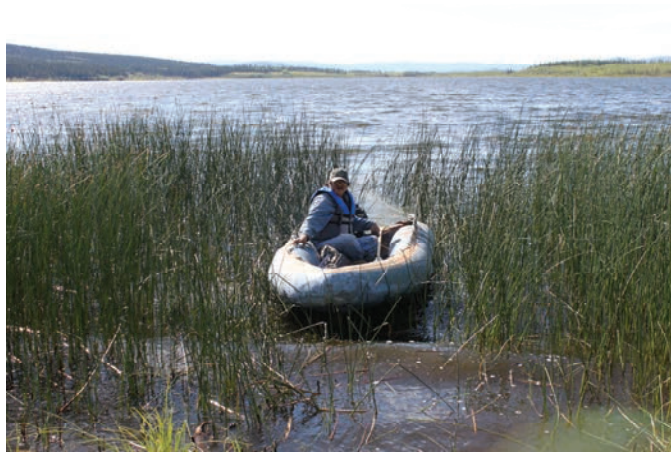
Staff enjoying a boat ride.