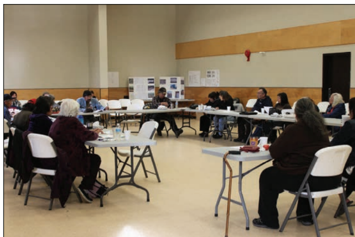
The Community Departmental Update Session was very informative, as each Department Director gave updates on current Programs and Services for 2013/14.