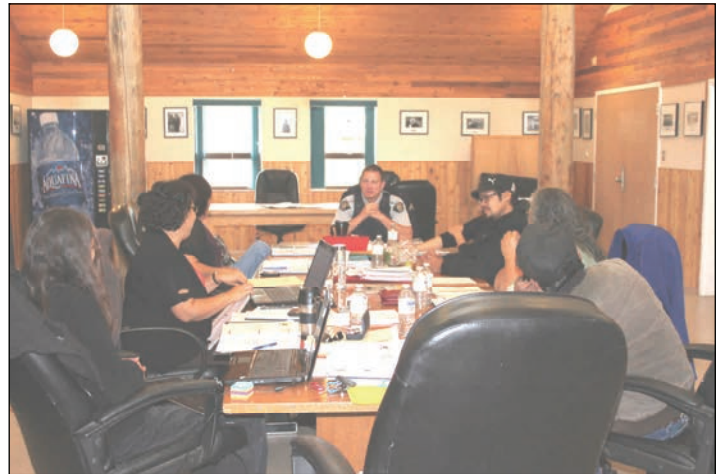
Chief & Council Meeting October 9, 2013 - Working In Partnership with Pelly Crossing RCMP.

If you have any questions, please do not hesitate to stop by the Executive office and we would be pleased to further elaborate on any of the above.