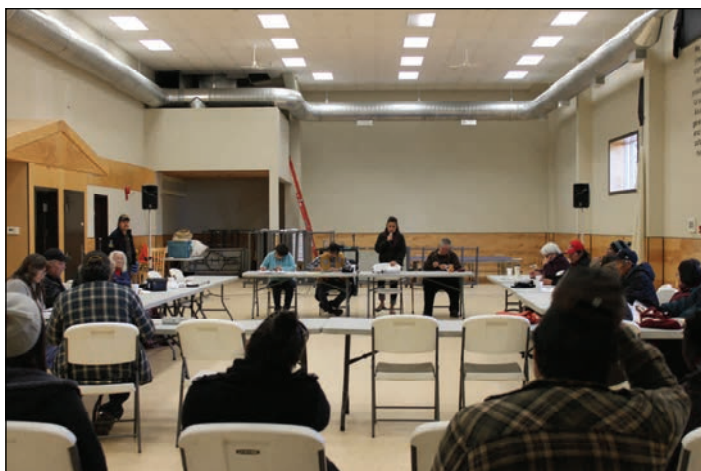
Chief and Council hosted a Update Session on September 25, 2013.