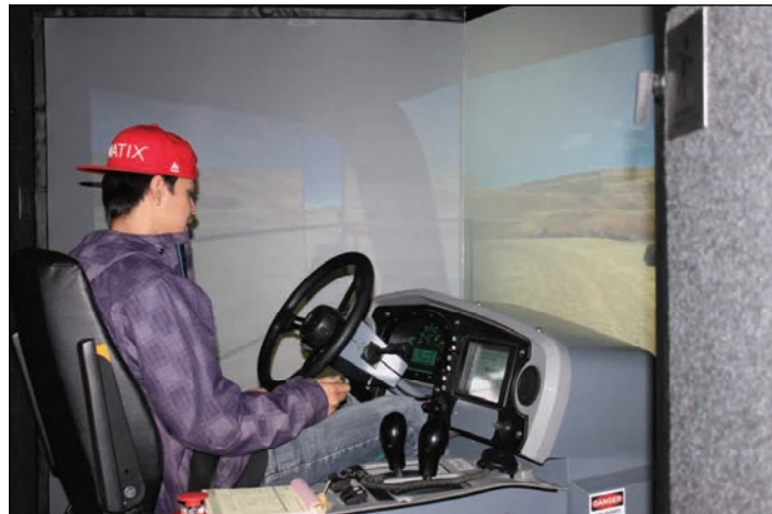
Some high school students tried out the heavy equipment simulator after the job fair.