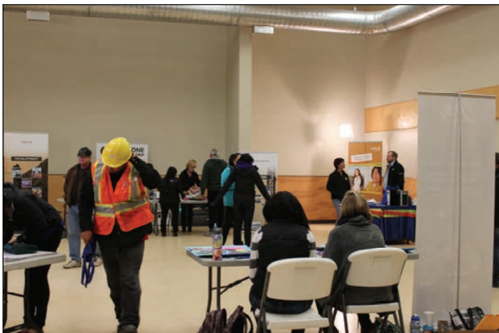
Minto Mine Job Fair, September 20th at the Link Building in Pelly Crossing. All the companies that operate at Minto Mine had booths.