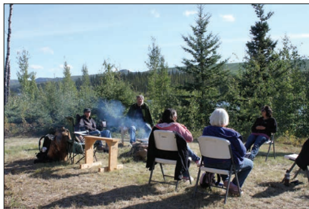
Staff relaxing around the campfire.