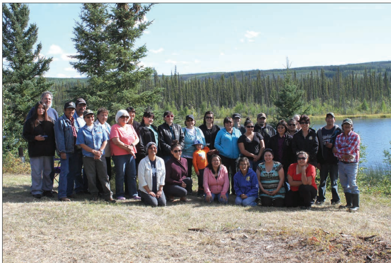
SFN Staff Appreciation Day at Lhutsäw (Jackfish Lake) page 13