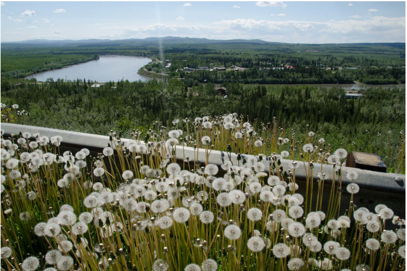
View of Pelly Crossing