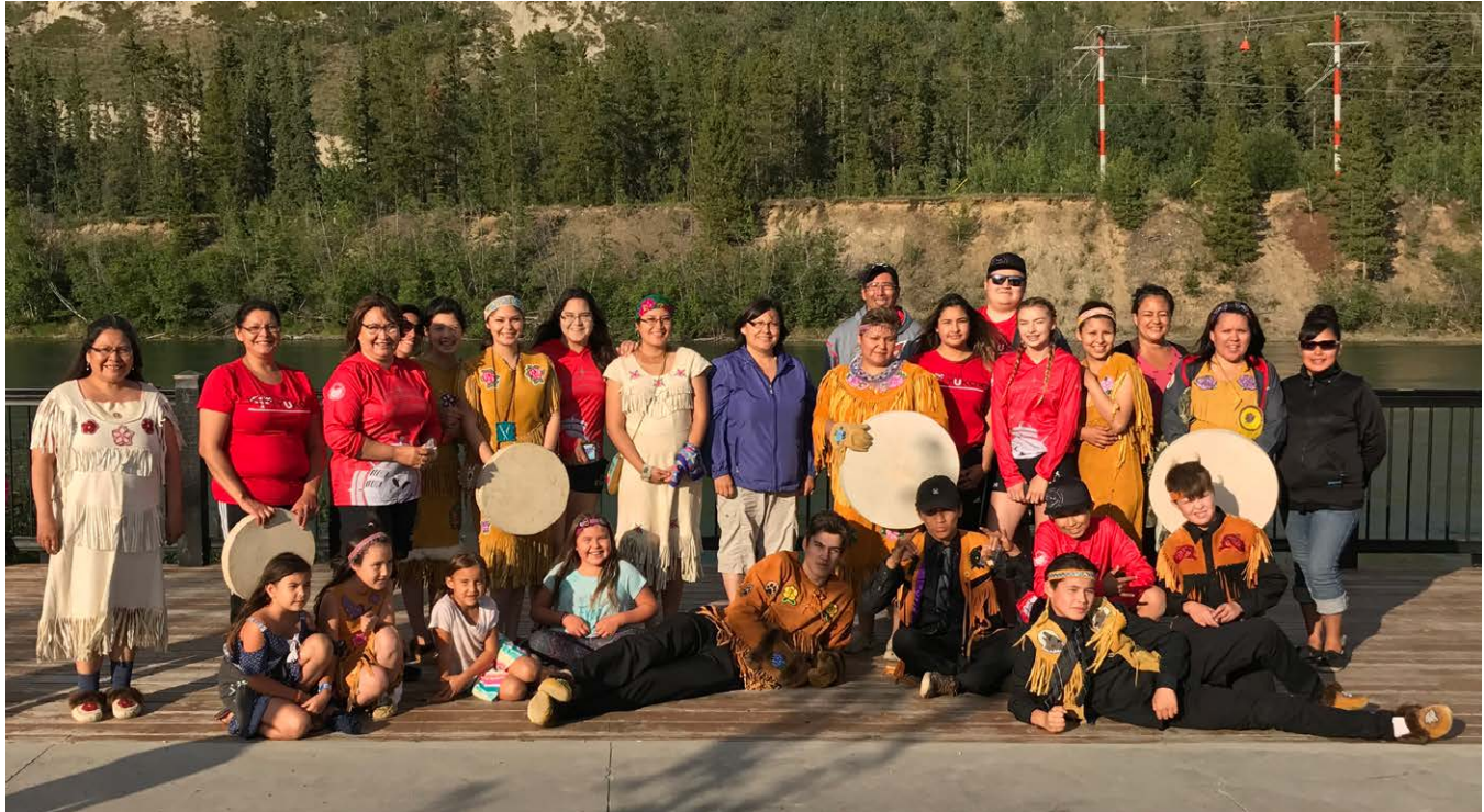
SFN Citizens at North American Indigenous Games