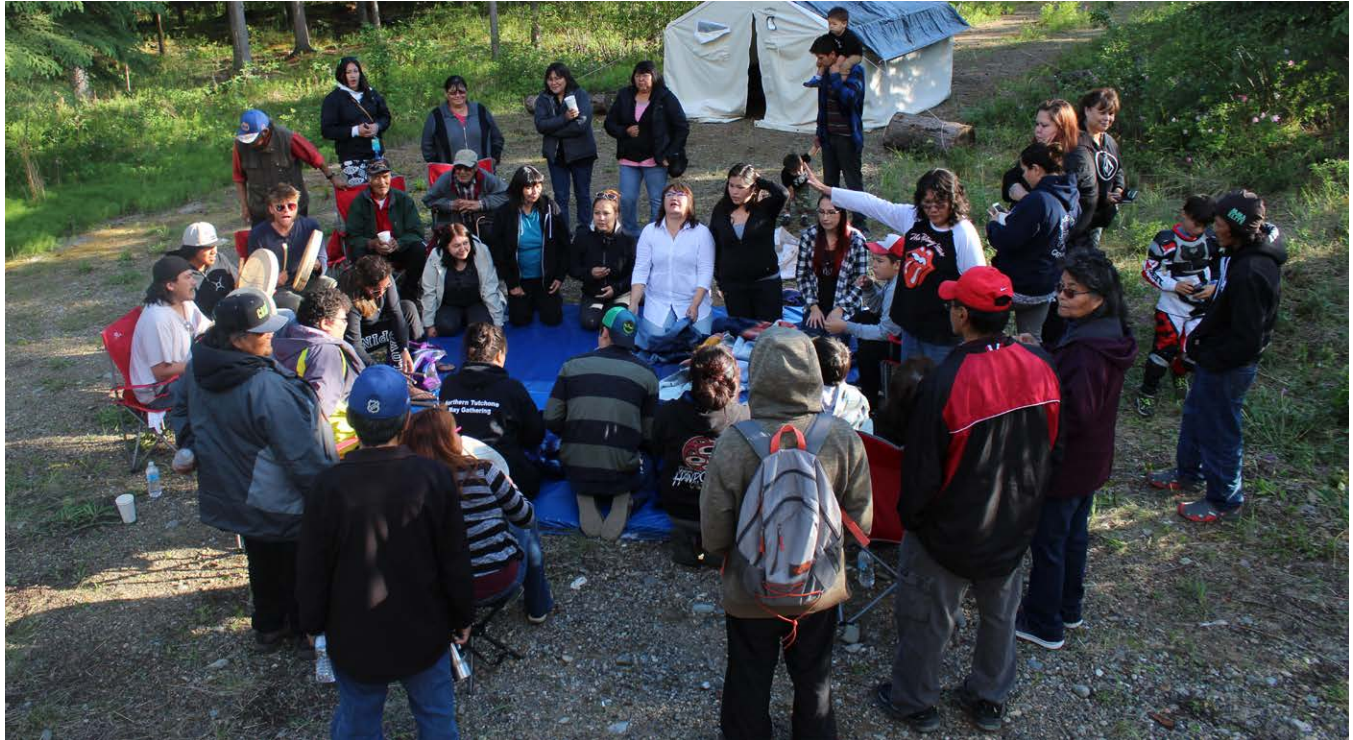
Yukon College Hand Games