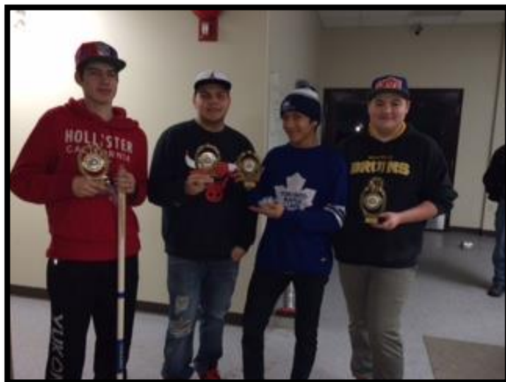
1st in the B division.