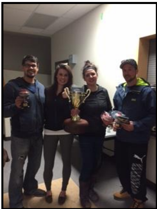
1st in the A division.