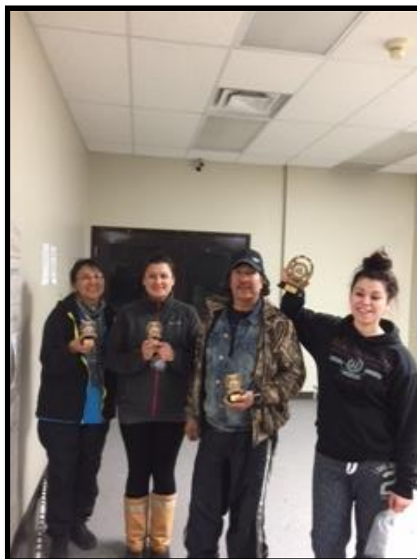
1st in the C division.