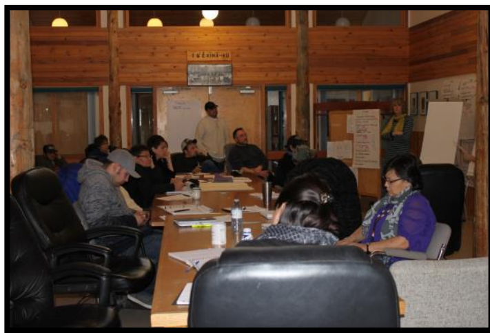
SFN Staff presenting their Workplans 2015/16 to Council.

S elkirk First Nation commenced the work planning session in late January. The strategic priorities that Leadership identified and the eighteen 2014 General Assembly resolutions are incorporated into the workplans. The next step will be to complete the budget with these additions. New items will include the staffing of senior management positions. The Executive Services Department will be split and three new positions created: Executive Advisor who will provide strategic advice to Leadership; Director of Operations who will manage the operational departments; Director of Governance who will be responsible for the Governing Bodies, legislation, regulations, policies, and communication. In addition, there will be a restructuring of the Elders Services. The Director of Human Resources will be filled on a contract basis and will be responsible for the Human Resource plans, systems, and operations.