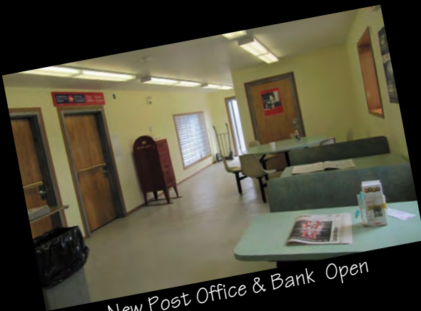
New Post Office & Bank Open