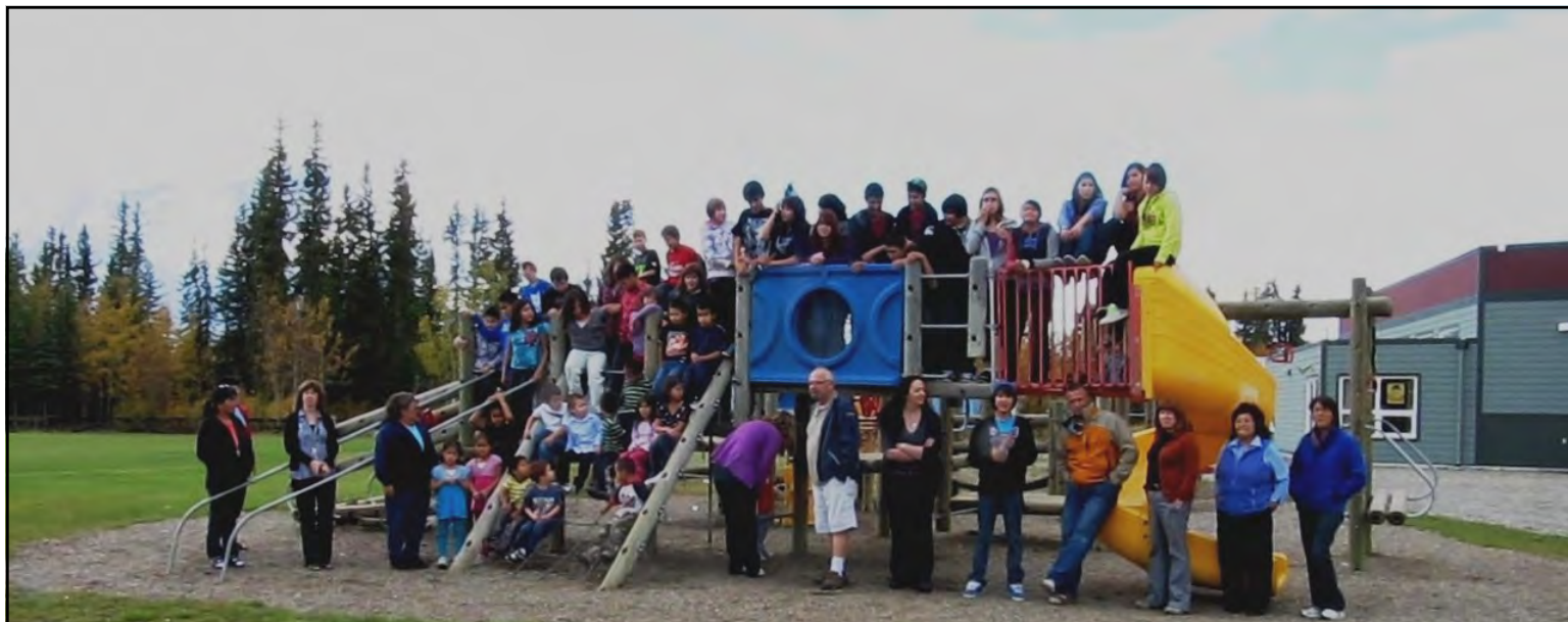
2010-2011 Picture Day at Eliza Van Bibber School