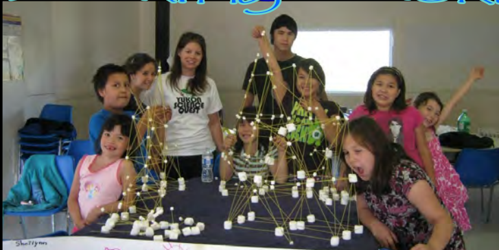
Pelly Crossing's First Science Camp