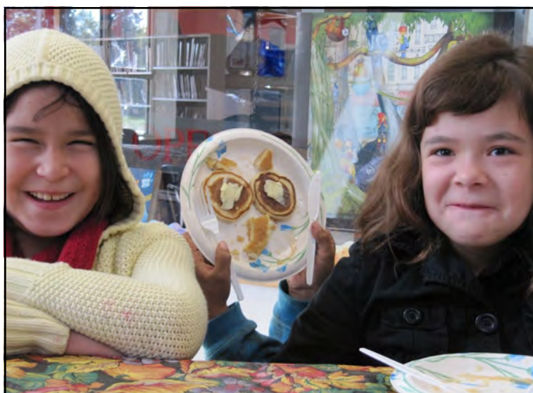
Community Pancake Breakfast September 8th