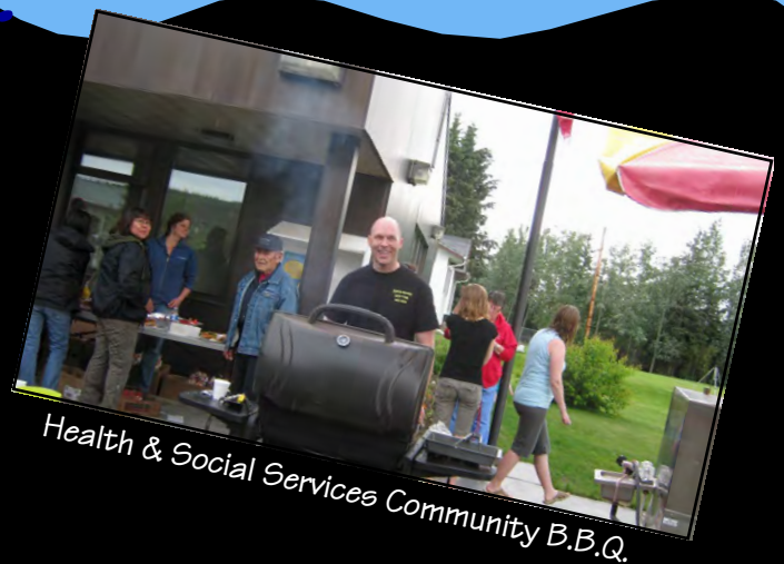
Health & Social Services Community B.B.Q.