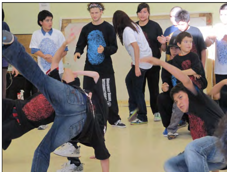
Students at BlueprintForLife Workshop October 7th