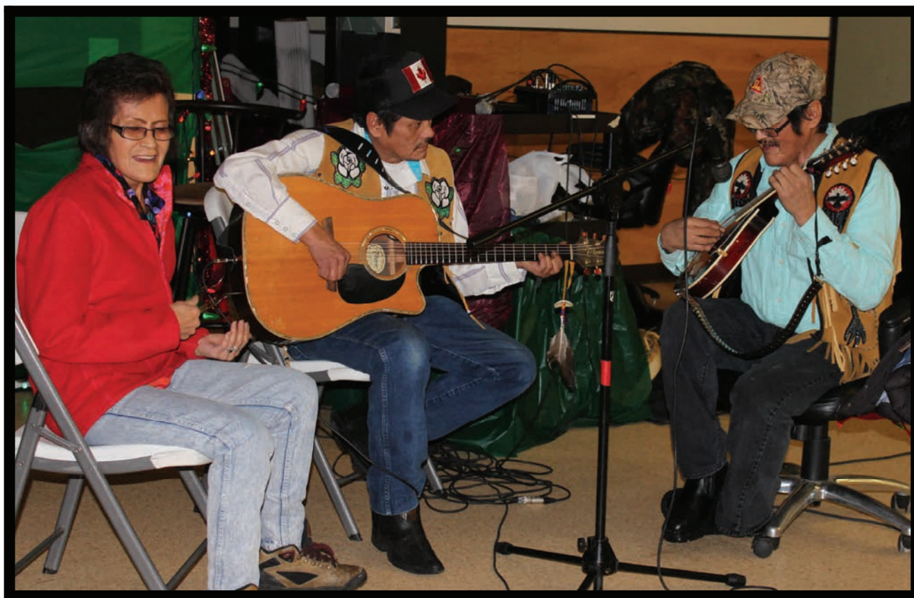
Sister and brothers jam out at the Elders Christmas Dinner December 18, 2013