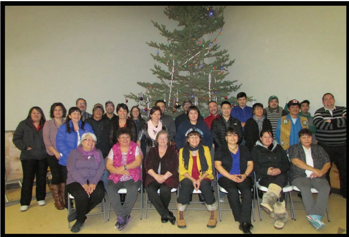
SFN Staff 2013! SFN OFFICE CLOSURE—DEC. 20TH, REOPEN—JAN. 6, 2014.

En cheng, en yaylea ke, en ching sothan no etud jun holiday season yeh.