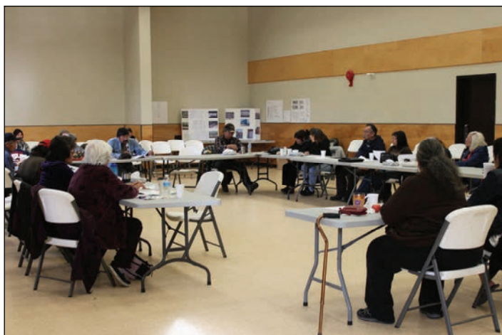
The Community Departmental Update Session was very informative, as each Department Director gave updates on current Programs and Services for 2013/14.