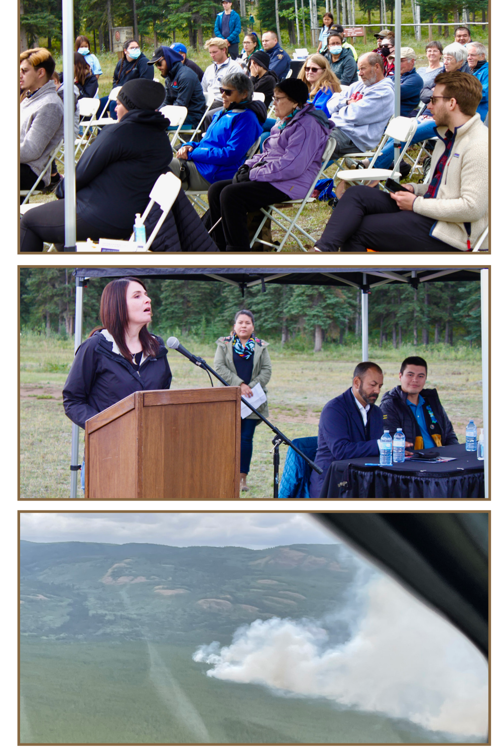
TA'TLA MUN LAKE FIRE (JULY, AUGUST 2021), COUNCIL FLEW OVER TO SEE THE EXTENT OF THE FIRE.